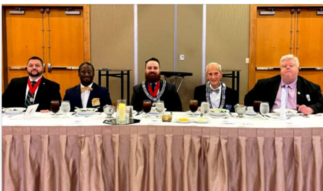
A motley Masonic crew indeed!