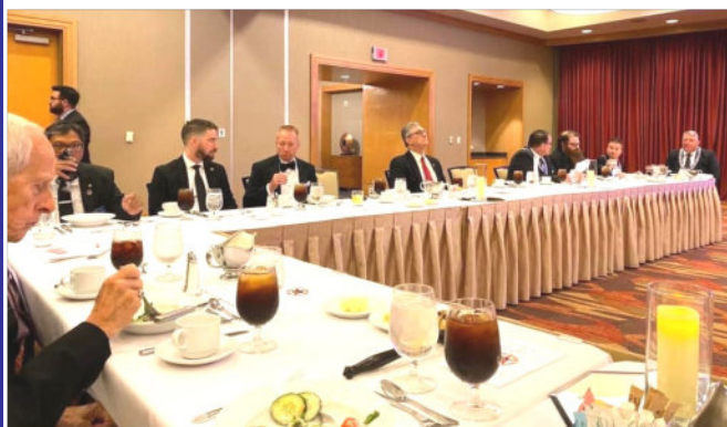
The Brethren of Gray Lodge and some of our Visitors