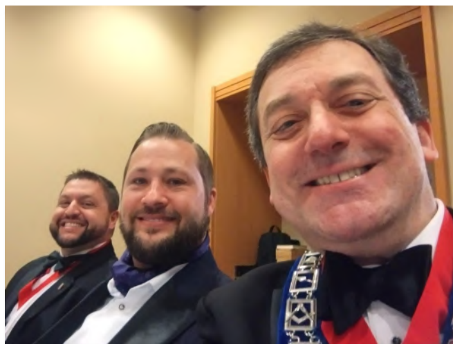
L to R: A past G.M., a present G.M., and a ... never mind