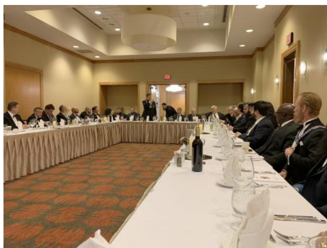
Brethren from several Lodges attended our Festive Board